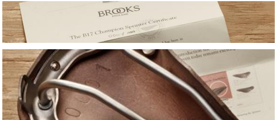
1925 Catalogue Brooks presents the Sprinter